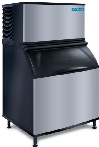
Koolaire KT-1700 Ice Kube Machine on K970 Bin

Koolaire by Manitowoc ice machines are designed, developed and tested by Manitowoc engineers to provide great ice production, energy efficiency and reliable service at an affordable price.